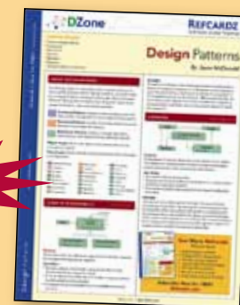
Design Patterns Published June 2008